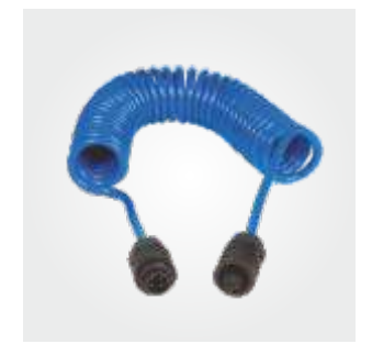
Cen-Stat cable supplied with male and female in-line Quick-Connects.

The spiral cable provides effective retractability when the clamp is not in use, ensuring the cable is neatly stowed and safely out of the way.