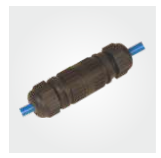
In-Line Quick Connect.

The Bond-Rite® EZ forms part of the Bond-Rite® range of Static Grounding and Bonding Equipment available from Newson Gale