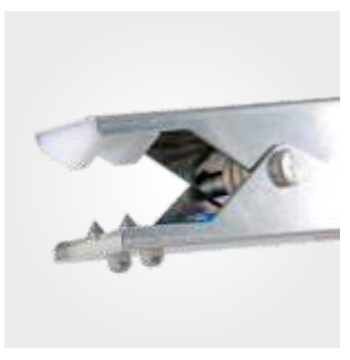
Tungsten Carbide Teeth