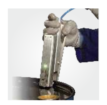
Bond-Rite CLAMP: Pulsing LED confirms equipment is grounded.