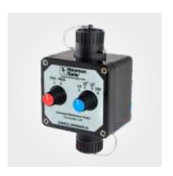
Universal Resistance Tester Product Code: URT.