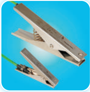
Heavy Duty & Medium Duty Clamps

The all stainless steel and ergonomic construction of the Cen-Stat range of static grounding clamps provide robust and long-life use in the harshest operating environments. The clamps are supplied in two sizes and are specified based on the operating environment and the size of the equipment to be grounded.