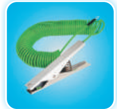
Hytrel® coated cable