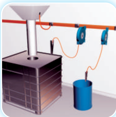
Grounding of metal IBCs and drums with clamps and retractable reels (more detail overleaf)