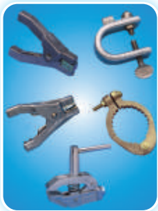
A comprehensive range of clamps and connectors are available for a wide range of applications