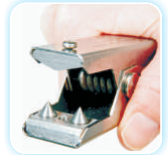
Hardened Tungsten Carbide Tips