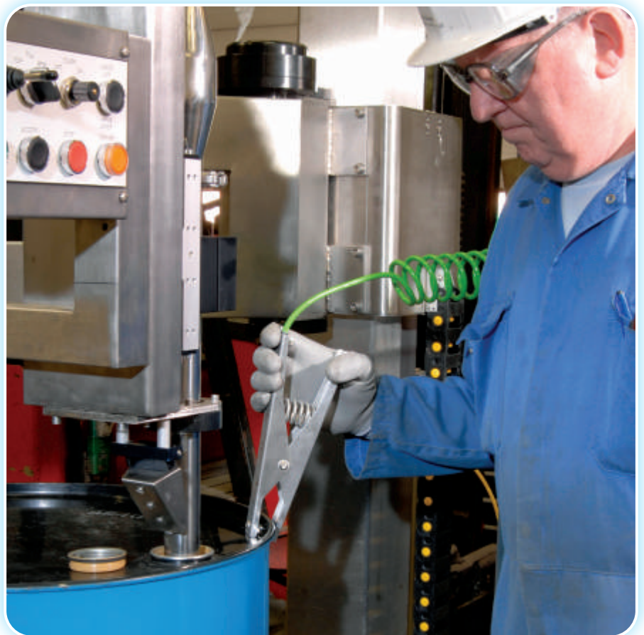
Cen-Stat clamps are designed to penetrate through coatings, hardened product deposits, rust and dirt to enable low resistance electrical connections to safely dissipate static electricity