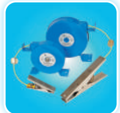
Self retracting reels