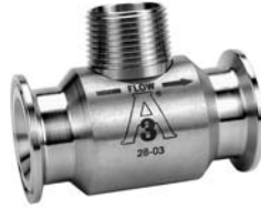
Sanitary Clamp Models