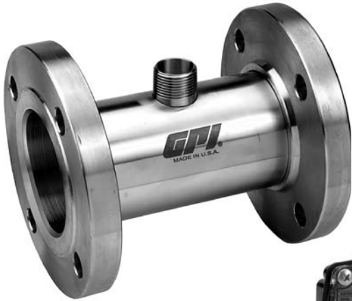
GFT shown here with Local Display