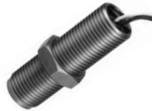
Local Pickup Wire Lead