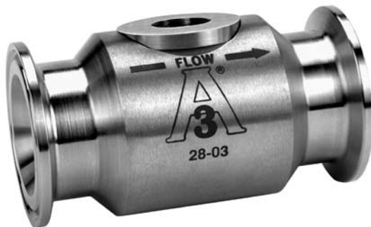
Model GSCPS Low Profile Sanitary Clamp