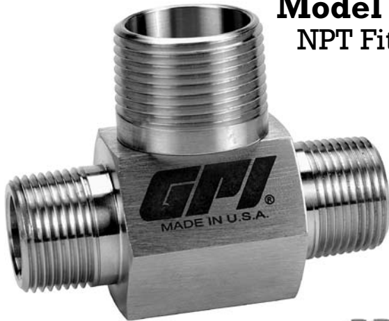
Model GNP NPT Fitting