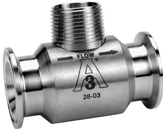
Model GSCPS Standard Sanitary Clamp